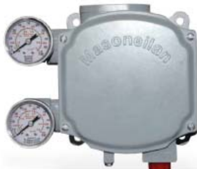
Figure 3 SVI1000: Started Shipping 2011