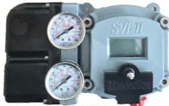
Recognizable Feature: SVI-II (with dash) shown on Display Cover