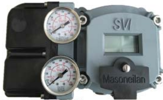
Recognizable Feature: SVI shown on Display Cover (Only change is SVI lettering on cover)